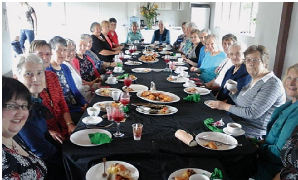
AAW of Belfast-Redwood, enjoying their end of year breakfast together.