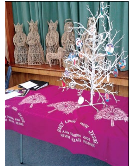
Kapiti Group's "Jesse Tree"