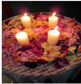
Advent Eucharist candles

Annunciation. Offerings were taken up, and $100 has been sent to the Lower Hutt Food Bank. Members lingered over the supper served after the Service.